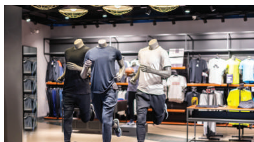
Large Global Sports Conglomerate turns to Cloudwick for Hadoop Migration